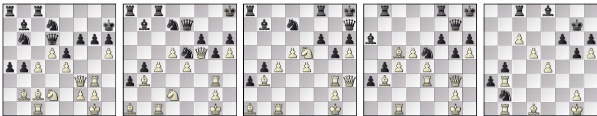
Fig. 3. LC0–HOUDINI, Game 8: positions (a) 27b, (b) 33w, (c) 35b, (d) 40w and (e) 54b.