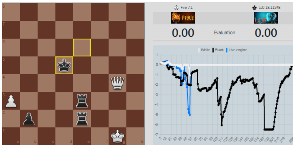
Fig. 4. FIRE–LC0, game 10. Kibitzing STOCKFISH’s evaluation, ‘draw’, agrees with FIRE’s from position 47b.

Once again, STOCKFISH sailed through undefeated, 4½-½ against CHIRON. FIRE-LC0 did not disappoint the record crowd and started with a bang: LC0 scored two quick wins. Undeterred, FIRE was the first engine to close a two-point gap, following a loss in game three with a win in ‘return game’ four and a win at the last gasp in game eight. Extra time beckoned with no penalty shoot-out on the agenda. Game 10 owed its 236-move length to LC0 not recognising that its attack would be unavailing: what else was