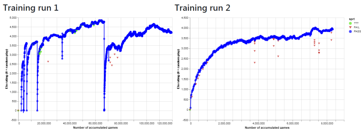
Fig. 6. Training Leela Chess Zero: ELO progress.