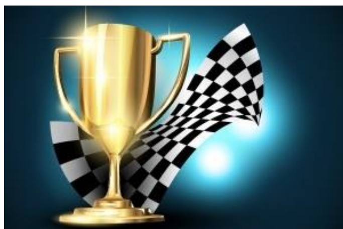
Fig. 7. The TCEC Cup, to be inscribed.