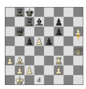
Fig. 5. Game 18 ST-LC (a) p9w, (b) p26w, (c) p26b, (d) p31b.

I had also seen LEELA play for this structure against FIRE in DivP in Season 18 with great success, but as a child I had been taught that this was a serious positional mistake (English GM Danny Gormally made the same remark in a Twitter conversation) as the strengthened Black centre and the open b-file should give Black plenty of counterplay. However, the loosening of the Black queenside and the advanced White kingside pawns make finding a safe spot for the black king problematic. Leaving it in the centre is fine to start with but if Black wishes to make use of its central pawn majority with ...d5, then the king should be somewhere else or White will sacrifice to open the centre! Black also has difficulties developing its kingside as ...Nf6 will get hit by g5. In its Black game, LEELA keeps the king in the centre, avoids ...d5 and essentially plays to survive the opening!