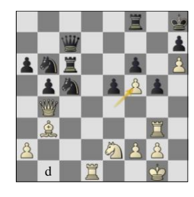
Fig. 13. Game 78 ST-LC (a) p25w, (b) p27b, (c) p30b, (d) p33b.

27..d7 +, Fig. 13b. A fantastic idea! The obvious 27.Nf5 is met by 27...Bc8 followed by ...Bxf5. The exchange of this fantastic knight and the destruction of the f5–outpost while doing so stabilises Black's position considerably. 27.d7 forces the black queen to d7 blocking the bishop's access to the c8–h3 diagonal thus enabling White to establish the knight on f5 for the foreseeable future. That's a lovely positional gain - the knight attacks squares close to the black king and takes away the d6 square from the black rook - but it's only a start. There is still a huge amount of work to do to turn this into something concrete: 27.Nf5 Bc8 28.Qb4 Bxf5 29.exf5 Nd5 30.Qb1 Rxd6 31.Bxb5+ Ke7 32.Bc4 Qb6.