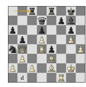
Fig. 1. Premier Division game 38/10.2 ST-AS (a) pos. 35w, (b) var. p37b: Superfinal g01 Lc-ST (c) p16w, (d) p25w.