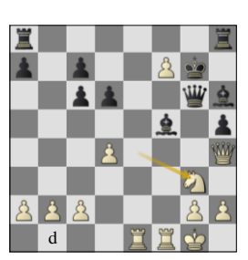
Fig. 4. Game 09 Lc-St (a) p9w, (b) p13b, (c) p16b, (d) var. p20b.

9.Bxc6 bxc6 10.0–0 Bg7 11.Be5 f6 12.Qh5+ Kf8 13.Bxf6 , Fig. 4b. LEELA continues in Romantic style throwing another piece onto the already flaming fire, but STOCKFISH was in no mood for roses and candlelight! Its evaluation rose to –1.5 and there was already talk of a double kill in this mini-match! 13...Nxf6 14.e5 Qe8 15.Qh4 Qg6 16.Rae1 , Fig. 4c. 16...Bf5 . After this last-minute decision from STOCKFISH, its evaluation aligned with LEELA's to approximate equality. 16...h5 17.Ne4 Bf5 18.exf6 Bh6 19.f7 Kg7 had been STOCKFISH's main line but it had seemingly misevaluated 20.Ng3, see Fig. 4d.