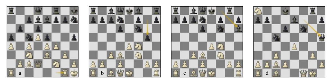
Fig. 8. (a) Game 48 ST-LC p18b: Sufi Bonus 2 game g55 STCLASSICAL-ST (b) p9w, (c) p11w, (d) p19w.

1.e4 e5 2.f4 Qf6 3.Nc3 exf4 4.Nf3 d6 5.Nd5 Qd8 6.Nxf4 Nf6 7.c3 Nbd7 8.Bd3 g5 , see Fig. 8b, an amazing idea. Considering Black has wasted two moves with ...Qf6–f8, I'm not sure why it should work... but it does! 9.Nxg5 Rg8 10.Nxf7 .