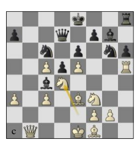
Fig. 3. Games 05-06: (a) g06 p12b, (b) g05, p34b, (c) g06, p19b.

It was turning into a real match! The next noteworthy moment was in a King's Gambit in game 9 where White was forced to sacrifice a piece Muzio-style on the f-file. Not a LEELA speciality and the (friendly!) trolling in the chat reached a peak as STOCKFISH claimed -1.55 and LEELA just -0.11! Was LEELA walking blindly into a losing line?