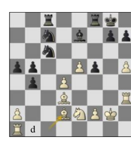
Fig. 12. Game 77 LC-ST (a) p13w, (b) p17b, (c) p20b, (d) p27b.

13...Bb7 14.Rh3 Nd7 15.Kg1 Bd6 16.Ng3 0–0 17.e5, see Fig. 12b. Thanks to still having the rook on the h-file, White is teeing up for the typical Bxh7+ sac. Black counters this by exchanging its light-squared bishop for White's king's knight, but by doing so loses its grip on its central and kingside light squares. 17...Bxf3 18.Qxf3 Be7 19.Ne2 a5 20.g4, see Fig. 12c, a really strong plan that caught me completely by surprise. Qe4 is coming next, forcing a concession on the kingside for White to target.