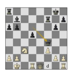
Fig. 7. (a) Game 33 LC-ST p18b: game 47 LC-ST (b) p5w, (c) p8w, (d) p24w.

5.e4 Be7 6.Bd3 0–0 7.Be3 g6 , Fig. 7c. This odd move received a few horrified remarks from me on Twitter, but it makes sense when you see STOCKFISH's follow-up. Black wants to strike in the centre with ...d5 and ...c5 and wants the knight to move safely to h5 after e5.