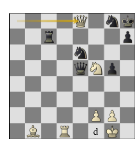
Fig. 14. Game 78 ST-LC (a) p41b, (b) p45b, (c) p57b, (d) p63b.

43...Ne7 44.Bg4 e4 45.Ra3, see Fig. 14b. The position still does not look too bad for Black - worse definitely due to the awkwardness of Black's pieces and its open king but surely not lost? Well the results of the many engine games I played from this and subsequent positions were overwhelmingly in White's favour. Black has to keep White's major pieces out of its back rank to protect its king; Black's only way of doing so is to move its knight to a6 (blocking the a-file and covering b8) but this stretches Black's defences (forcing Black to protect the knight with rook and queen) while depriving the kingside of a defender. Secondly, Black has no way to create pressure against White's king and no way to safely force the exchange of queen or rook. In essence, Black must wait in an uncomfortable holding position while White optimises its pieces to force a breakthrough. It takes a great deal of accuracy from White to keep Black tied down while improving its position, but STOCKFISH is definitely the engine to do it!