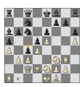
Fig. 2. Games 05-06: (a) g05 p14b, (b) g06 p9b, (c) g05 p17w.

Games 5-6. Neither STOCKFISH nor LEELA budged an inch on the Black side of a Bayonet King's Indian in games 3 and 4, but games 5 and 6 saw first blood with two convincing wins on the White side of an offbeat French (1.e4 e6 2.d4 d5 3.Nc3 Nf6 4.e5 Ng8). It transposes into a French Winawer line that Petrosian and Bronstein used to play (1.e4 e6 2. d4 d5 3.Nc3 Bb4 4.e5 b6 5.a3 Bf8) and it's a line that every French player has considered as a way of sidestepping theory. It's perfect against an attacking player, less good against a strategical player and both LEELA and STOCKFISH demonstrated perfect strategy: