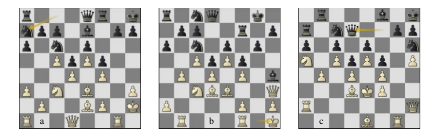
Fig.\ 9.\ (a)\ Game\ 60\ ST-LC\ p19w:\ (b)\ Nielsen-Savko\ (EU-ch\ U18\ Vejen\ 1993)\ p18b:\ (c)\ game\ 60\ ST-LC\ p143w.

Finally, in game 60 STOCKFISH outlasted LEELA in a mammoth 164-move game in the Alekhine's Defence. I'd be lying if I said that every move was a pleasure to watch but when the end came, you realised it had been worth waiting for!