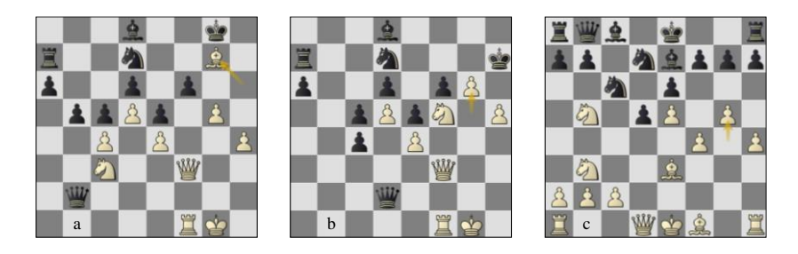
Fig. 11. Game 61 LC-ST (a) p29b, (b) p34b: (c) game 67 LC-ST p15b.

152...Kd8 153.Rgg7 Na8 154.Rh8+ Kc7 155.Rhg8 , Fig. 10d. Incredible! How does White have so much time to do this? 155...Ra4 156.h7 Rxa5 157.h8Q Nb6 158.Re8 Nc8 159.Rxc8+ Qxc8 160.Rxe7+ Kb8 161.Qxc8+ Kxc8 162.Rxa7 Kd8 163.Rxa6 Rxa6 164.Bxa6 h4 1–0 .