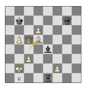
Fig. 6. Game 18 ST-LC (a) p36b, (b) p40b, (c) p47b.

Another wonderful move! Now it's White attacking on the queenside as well! 40...cxb4 41.axb4 Rxg7 42.Qc5+ Kb7 43.hxg7 Re1+ 44.Kb2 Qf6+ 45.c3 Qxg7 . The h-pawn is stopped on the brink of the try line, but White's remaining trumps are more than enough: the exposed black king and the passed d-pawn. 46.b5 Be4 47.Bd5+ , Fig. 6c. Again, STOCKFISH exchanges its attacking pieces to prosecute its attack! Really unusual! 47...Bxd5 48.Qxd5+ Ka7 and Black resigned as 48...Ka7 49.d7 wins!