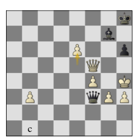
Fig. 17. Game 92 ST-LC (a) p34w, (b) p36b, (c) p50b.

36...Qf5 37.Qxb6 Qc2 38.Qd6 Qe2 39.Qd7+ Kg6 40.Qe6+ Kh7 41.Qf5+ Kh8 42.c5 Qe3+ 43.Kg2 Qxc5 44.Qe6 Qb5 45.Kh3 Qf1+ 46.Kh4 Qg2 47.h3 Qf3 48.Qc8+ Kh7 49.Qf5+ Kh8 50.e6, see Fig. 17c. 50...Qxb3 51.e7 Qg8 52.Qg6 Qc8 53.e8Q+ Qxe8 54.Qxe8+ Kh7 1–0.