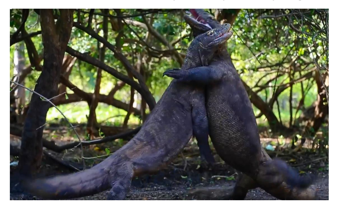
Fig. 2. Two Komodo dragons head-to-head: fighting, not foreplay. Ringside seats still available.

after 28. ... Rbd8 . Enter the dragons, KOMODO and KOMODOMCTS, over-hungry after the delay and more than ready for a fight, see Fig. 2. After much effort, the upstart newcomer overturned the seeding even more than HOUDINI, its win in the last of the eight scheduled games allowing no response.