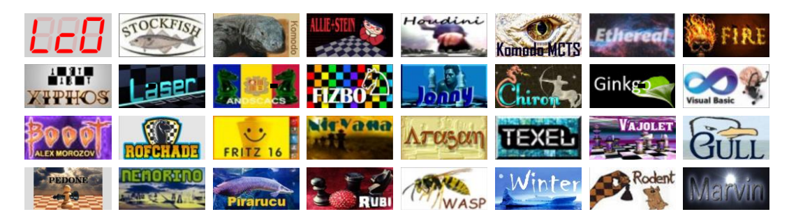
Fig. 1. Logos for the TCEC Cup engines in their seeded order (LEELA CHESS ZERO \rightarrow STOCKFISH \rightarrow ... \rightarrow MARVIN).

The usual 'TCEC opening' team, the second author here and Jeroen Noonen, randomly chose from three books with some regard for frequency over the board. Greater variety of play ensued from round 1's 8-ply openings and 12-ply openings thereafter up to and including the semi-finals. The final took openings of various lengths from JN's TCEC Superfinal books for seasons 9-14.