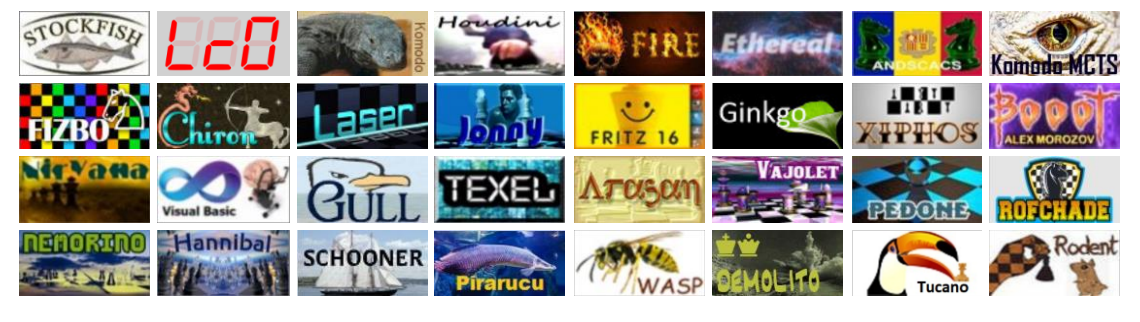
Fig. 1. Logos for the TCEC Cup engines in their seeded order (STOCKFISH \rightarrow LEELA CHESS ZERO \rightarrow \dots \rightarrow RODENT).

The format was of 8-game matches at the Rapid tempo of 30′+5″/m rather than the '+10″/m' of TCEC Cup 1. This time, all eight games were played whatever the running score. Openings were repeated with colours reversed after every odd-numbered game. The first few ply in all games were randomly selected from two sets of openings created by the second author here, their relative frequency reflecting that seen in human play: over 200 four-ply openings constituted the repertoire for the opening round of 32 and over 300 twelve-ply openings served thereafter. Tiebreaks were resolved, this time at end of round, by further pairs of games with openings after game 16 from 232 TCEC Superfinal 9-13 options. There was no Armageddon backstop even though the longest TCEC Cup 1 match went to 20 games. Adjudications were as for TCEC14.