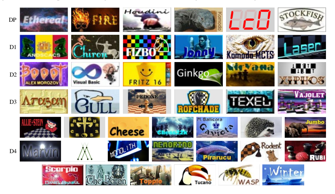
Fig. 1. Logos for the TCEC 15 engines (CPW, 2019) as in their original divisions.

TCEC Season 15 started on March 5<sup>th</sup> 2019 with a more liberal Division 4 featuring several engines in their first TCEC season. At the top end, interest would centre on whether the recent entries, ETHEREAL, KOMODO MCTS and LEELA CHESS ZERO would again improve their already impressive performances. Fig. 1 and Table 1 provide the logos and details on the enlarged field of 44 engines.